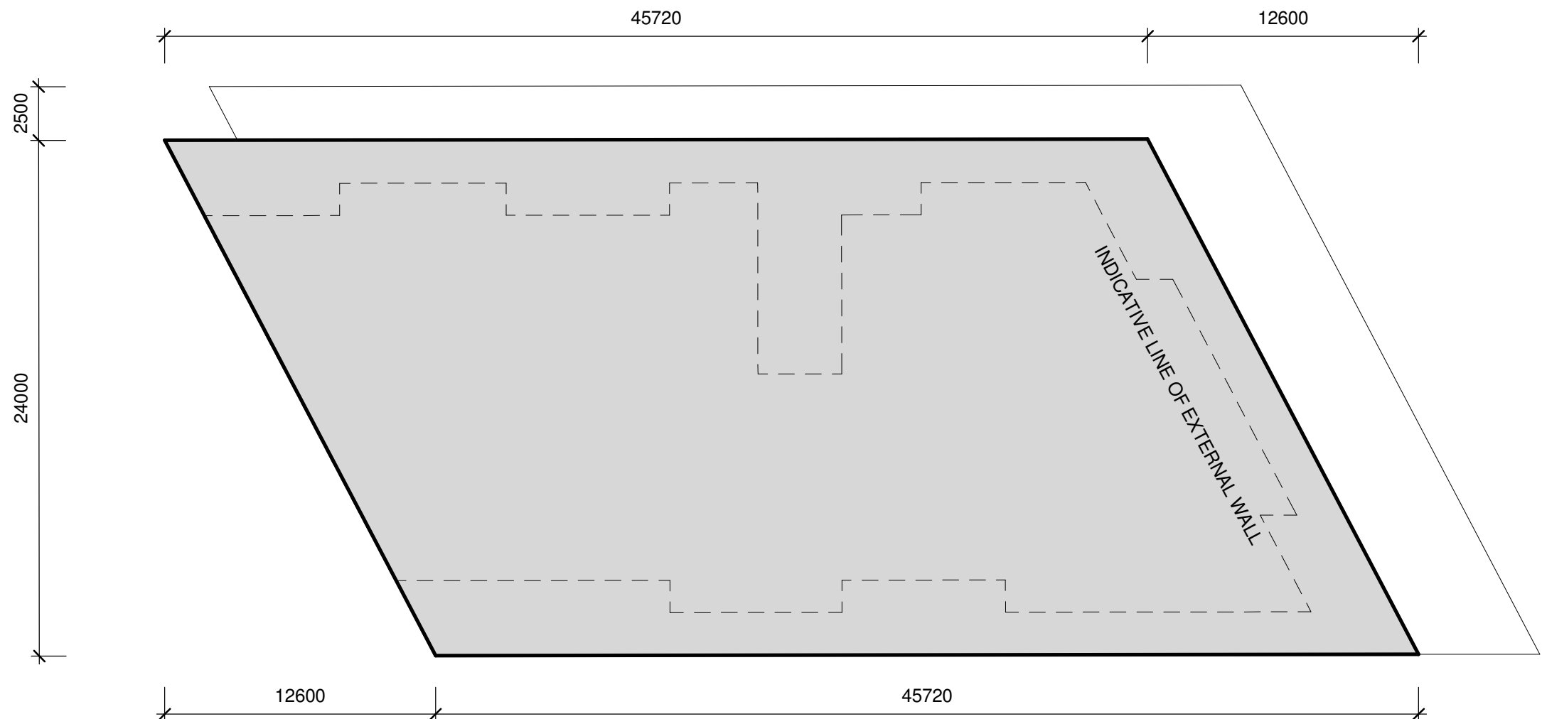
2 Typical Level Plan 1 : 250